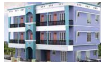
Blueberry @ Vattiyoorkavu