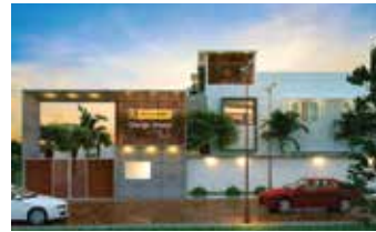
Orange Woods Near Technopark