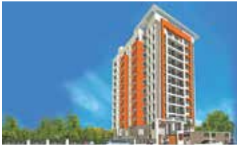
Metro Square @ Pattom