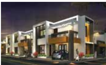
Centre Point @ Sreekariyam