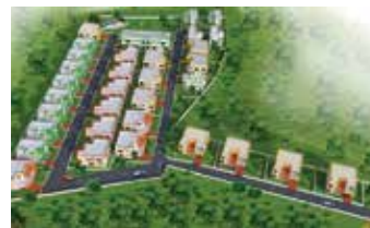
Cyber Fort @ Kazhakkuttom