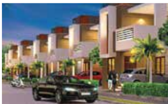
Palms Villa @ Kazhakkuttom