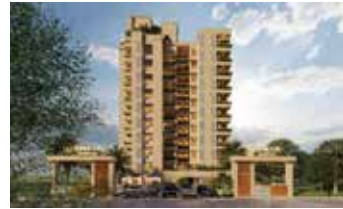
Thakshashila @ Sreekaryam