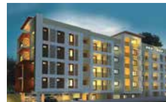
Nalanda @ Sreekariyam