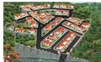
Indigo Hills @ Peroorkada