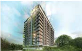
Tech Meridien Near Technopark