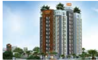
Amar vista Near Technopark