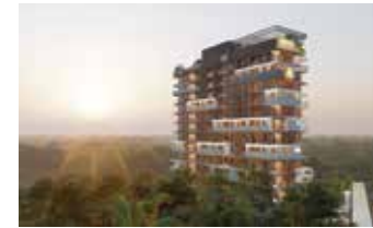
Rainbow Heights Near Technopark