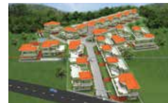
Zenana Enclave @ Thirumala